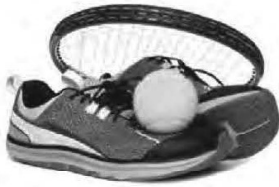
1 sports shop

1 A Write the shop names under pictures 1–10.