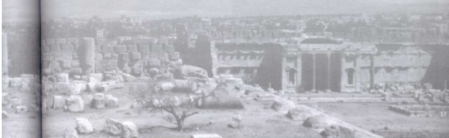
The Temple of the Sun, Baalbek, Lebanon

E Of all the images that passed before my eyes in mid-childhood, two affected me like summonses. One was a colored illustration on the cover of a geography book of the young Christopher Columbus, the man who discovered the Americas, gazing westward from a deepwater dock in Genoa. There, I thought, was a boy no older than me who, just like me, had the whole world in his head and still looked forward to another. The second was a painting of what seemed to me a celestial city. Situated at the conjunction of a river and an ocean, it was the scene of dazzling energy as flotillas of ships steamed in and out, railroad trains snaked across lacework bridges, and airplanes soared above steeples and tall smokestacks. I knew at first glance that in New London, Connecticut, I had seen the city of my dreams.