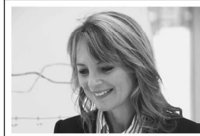
Maria, working mother

4 A Look at the table and complete the questions about Maria.